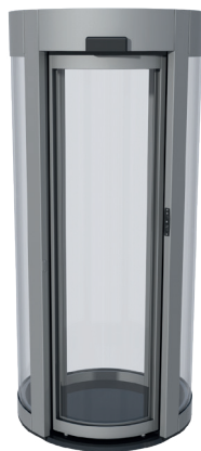
HiSec 2 7

The HiSec 2 is equipped with electronic safety features that reverse the motor to re-open the door upon detection of an obstruction. The door fully opens to allow the obstruction to be removed after which it attempts to re-close.