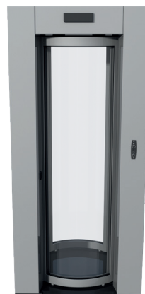
HiSec 2 7-SQ