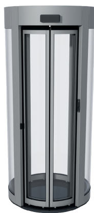
HiSec 2 7-2D